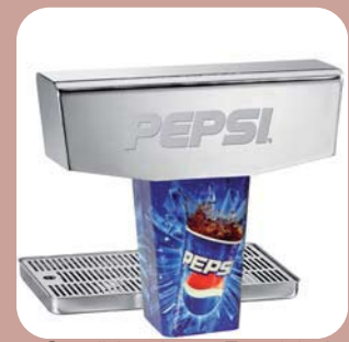
Sandblast logo+Foot label