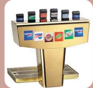
Illuminated product labels