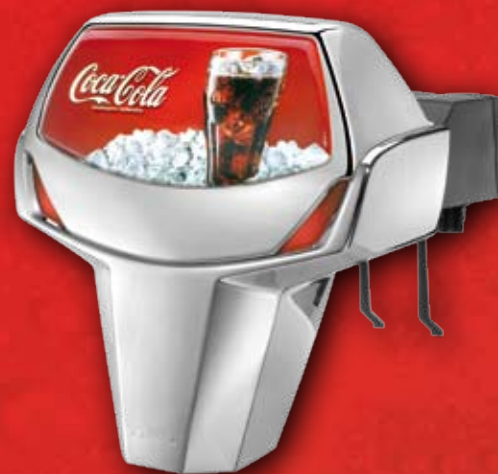
Nueva Style Taxi

IMI Cornelius Europe www.imi-cornelius.net