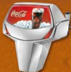
6-valves Premix Taxi