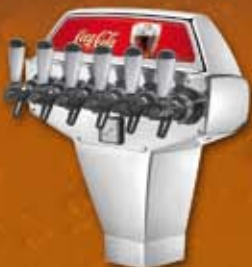
6-valves Premix Taxi