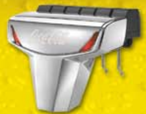
6 valves SFV1 Sandblasted