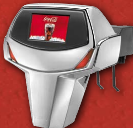
Nueva Style LCD