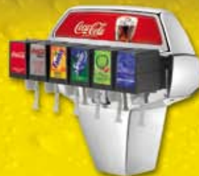
6-valves SF1 Taxi